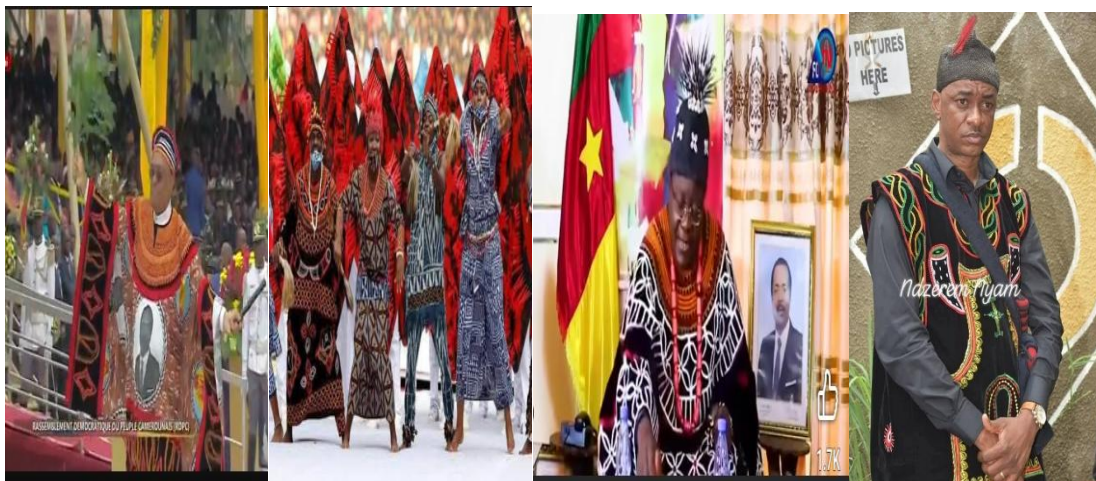
Figure 3: Toghu as a State Ceremony

The five figures collectively provide a layered visual narrative of Toghu as both a cultural marker and a national emblem. Through ceremonial display, performative adaptation, diasporic circulation, and artisanal production, the images demonstrate how material culture operates as a visible and embodied site of identity formation.