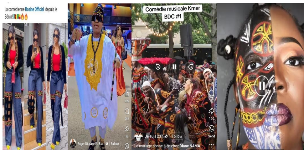
Figure 5: Diasporic Display of Toghu

Figure 4 shifts the visual focus from institutional authority to performative identity worn by contestants in a cultural festival or beauty pageant. Here, Toghu becomes an aesthetic language through which cultural pride is staged and celebrated. The stylized presentation of Toghu—particularly in women’s gowns—demonstrates how tradition is reimagined within modern cultural platforms. This performative context underscores Toghu’s capacity to foster multicultural recognition: participants from diverse regions embody a shared national aesthetic without relinquishing individuality. The image foregrounds cultural agency, especially women’s role as both wearers and cultural ambassadors who reinterpret heritage for contemporary audiences. how Toghu promotes multicultural recognition by allowing participants from diverse regions to embody a shared national aesthetic while retaining individuality. It further highlights women’s central role women’s role as both wearers and cultural ambassadors who reinterpret heritage for contemporary audiences by preserving, modeling, and reinterpreting indigenous material culture.