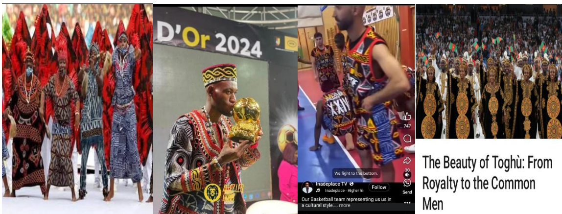
Figure 6: Toghu during sporting events

Figure 5 captures members of the Cameroonian diaspora wearing Toghu during an international gathering. It expands the analysis beyond territorial boundaries. In diasporic contexts, Toghu functions as a portable emblem of homeland identity. Visually, the garment anchors dispersed communities to a shared cultural memory, transforming it into a transnational marker of belonging. The repetition of Toghu in international gatherings reinforces collective identity across geographic space, demonstrating how material culture sustains national consciousness beyond state borders. This image affirms that national identity is not confined to territory but can be embodied and performed globally through symbolic attire. The image further demonstrates how Toghu facilitates national integration not only within Cameroon but also among diaspora populations, strengthening symbolic unity across geographic divides.