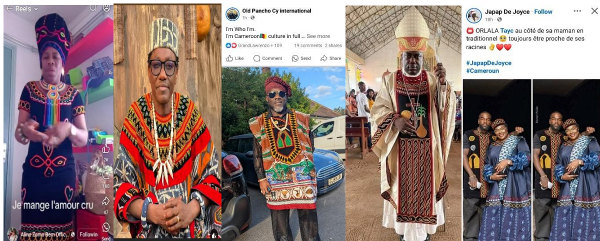
Figure 2: Cameroonian from different linguistic and ethnic groups dressed in toghu

One of the most striking arenas in which Toghu has gained integrative significance is sport. Major national and international sporting events hosted by Cameroon have increasingly featured Toghu as part of official cultural representation. During tournaments such as the Africa Cup of Nations 2021, Toghu appeared prominently in opening ceremonies, cultural displays, and fan attire, visually projecting a unified national identity to domestic and global audiences. Athletes, performers, and supporters wearing Toghu symbolically reframed regional heritage as collective national pride. According to the Confederation of African Football (2021), the official 2021 Africa Cup of Nations match ball was named “Toghu” after the iconic Cameroonian attire, and accounts of Toghu’s global presence show its growing role as a symbol of national identity (237Check, 2024).