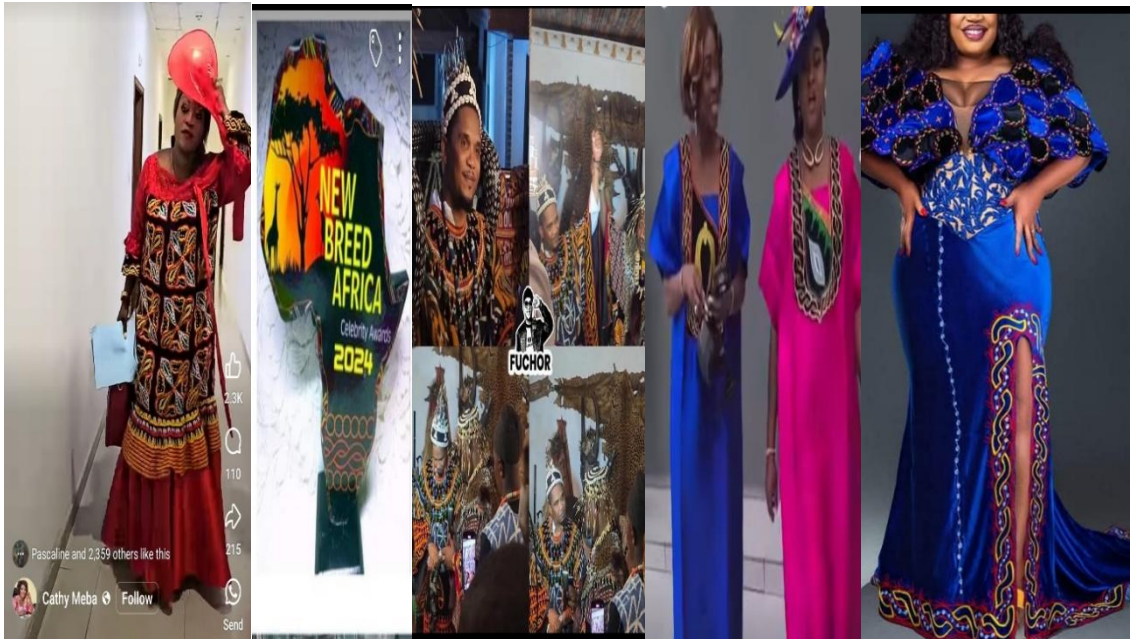
Figure 1: Screenshots of Cameroonians from different cultural backgrounds in toghu designs