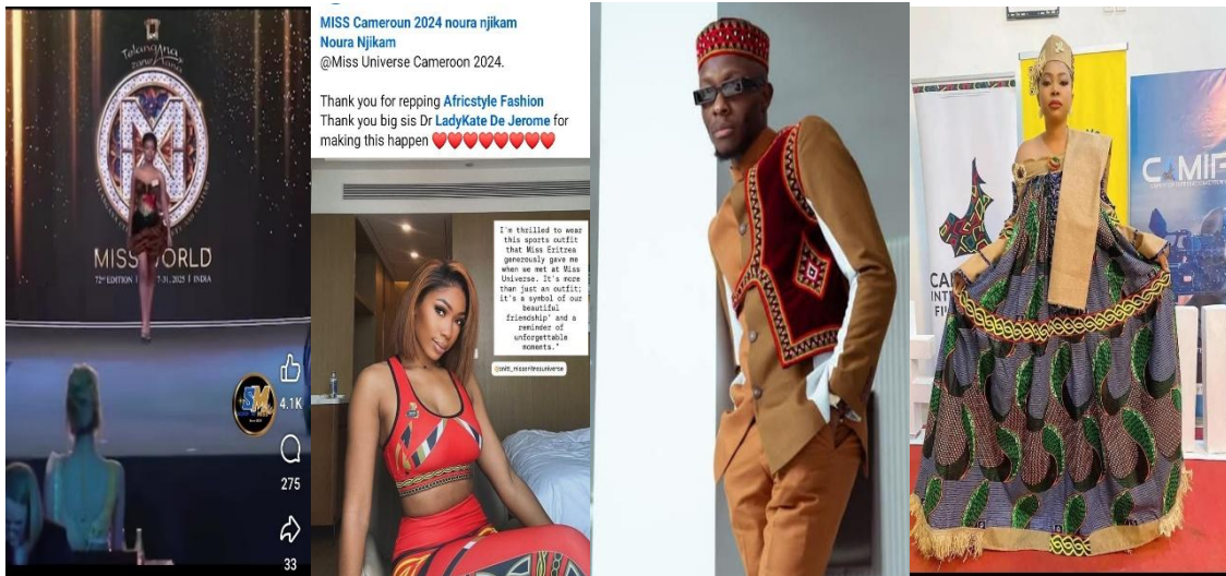
Figure 4: Toghu in Cultural Festivals and Beauty Pageants

Figure 4 shifts the visual focus from institutional authority to performative identity worn by contestants in a cultural festival or beauty pageant. Here, Toghu becomes an aesthetic language through which cultural pride is staged and celebrated. The stylized presentation of Toghu—particularly in women’s gowns—demonstrates how tradition is reimagined within modern cultural platforms. This performative context underscores Toghu’s capacity to foster multicultural recognition: participants from diverse regions embody a shared national aesthetic without relinquishing individuality. The image foregrounds cultural agency, especially women’s role as both wearers and cultural ambassadors who reinterpret heritage for contemporary audiences. how Toghu promotes multicultural recognition by allowing participants from diverse regions to embody a shared national aesthetic while retaining individuality. It further highlights women’s central role women’s role as both wearers and cultural ambassadors who reinterpret heritage for contemporary audiences by preserving, modeling, and reinterpreting indigenous material culture.