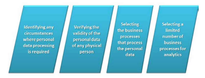
Figure 1. The steps to protect the personal data

Personal data protection is a set of organizational and technical measures aimed at protecting the personal data of a physical person (subject of personal data) based on the specified information [1]. Personal data protection is included in the labor protection section of an institution. A state guarantees the protection of the workers' labor rights taking into account the use of their personal data (ID cards). The steps to protect the personal data is illustrated in Figure 1.