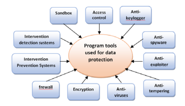
Figure 2. Program tools used for data protection

IS refers to data storage, retrieval and processing and the provision and dissemination of relevant organizational resources (people, techniques, etc., ISO / IEC 2382: 2015) [4].