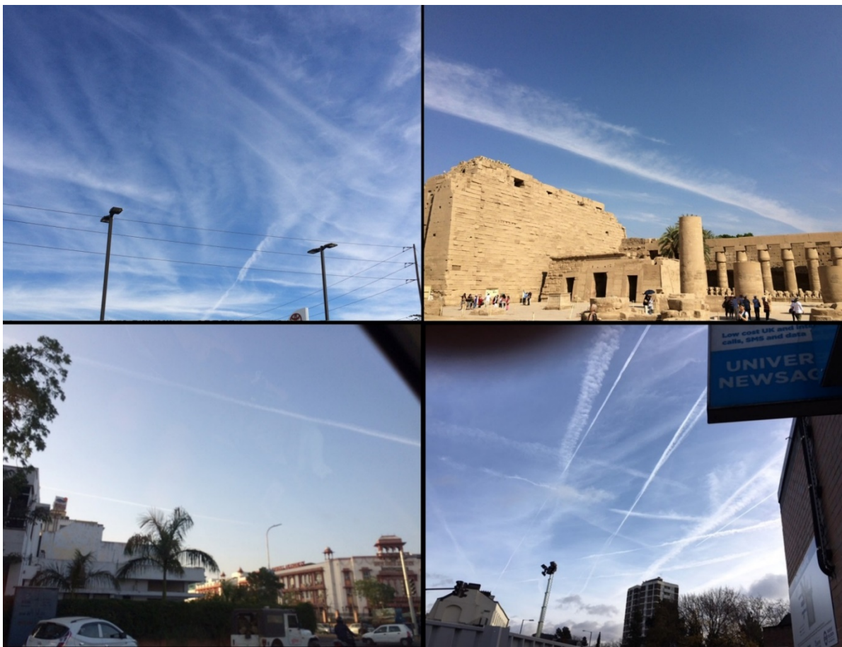
Figure 2. Environmental modification tropospheric particulate trails. Clockwise from upper left: San Diego, California, USA; Karnack, Egypt; London, England; Jaipur, India. From [9].

Particulate trails across the sky, like those shown in Figure 2, have concerned observant citizens for at least two decades, especially as they have become more frequent occurrences [17, 18]. Not only has there been no public disclosure as to the nature of the particulates jet-sprayed into the region where clouds form, but there has been a systematic pattern of false information alleging the trails to be harmless ice-crystal contrails from moisture from engine exhaust [19-21].