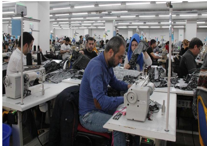
Figure 12. " Corona Virus paved the way for the order of 3 billion dollars."