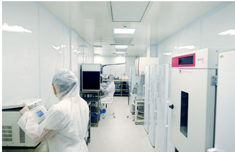
Figure 16. " First new Corona treatment in Turkey." Resource: www.sozcu.com.tr , 28.03.2020.

Corona virus outbreak is described as the turning point vaccine studies, along with Turkey, began in China, Russia, France, Germany and America. In addition, countries make commitments according to the interface discipline by giving the date of the vaccine (several months / one year) in order to establish a safety footing in the markets. Considering the new identities in the field of possibles, countries and scientists who carry out vaccination studies, we come up with new social relations.