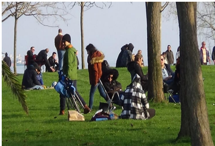
Figure 2. "Police Warns Picnicers With Drone: Don't Go Out On The Street."

Due to the Corona virus epidemic, government officials reveal how social roles are executed (how they are forced to enforce), how social relations are suspended, and prohibitions with penal sanctions. However, the current government is also informed that the practices / coercions in social relations will disappear after the pandemic process ends. However, as Goffman (1959) points out, it is a natural process to avoid in fulfillment of roles as well as every role expectation.