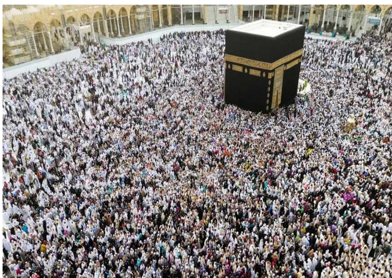
Figure 9. "Umrah Visits Are Suspended.

According to White (2008) ambiguity indicates uncertainties in the network of meanings. It explains the uncertainties arising from the way an identity that occurs in uncertainty, interprets language or signals in a particular environment. Ambiguity is also related to the rules. Because ambiguity arises in understanding which rules belong to certain signs. Corona virus outbreak occurred in the world towards the end of December 2019. Corona before starting to spread viruses countries, Turkey has begun to take measures on many issues related corona viruses. January and February in Europe, Middle Asia, America begin seeing corona virus, the first cases in Turkey March 10, 2020 from "Umrah visit" was also seen among the returnees. It is noteworthy that the government, which has taken measures in many areas and institutions of the society since the Corona virus epidemic started to appear, has not taken any measures regarding the visit to Umrah. Because it is thought that changing the rules (meaning) of worship, which is considered sacred by the whole society, will cause reactions and fluctuations in the society.