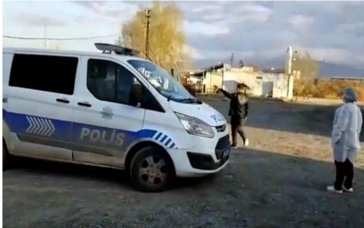
Figure 5. "Escape from Quarantine: Police Caught and Brought." Resource: www.sozcu.com.tr , 16.03.2020.

curfew and fines, individuals over 65 years of age do not fulfill their social roles. The gendarmerie and police teams commissioned for the implementation of the ban, fined many individuals over the age of 65 and direct them to their homes. However, individuals avoid meeting the expectations of the role by stating that they do not know about the epidemic, and the reasons as shown in the identity of their ages. However, in many cities, it is seen that sitting benches are collected or surrounded by wire fences in order to provide social isolation of individuals over 65 years of age. Despite all the precautions taken, individuals over 65 years old come together in the same areas and do not suspend their social relationships. Ambage is mostly involved in "curfew" due to major disruptions in meeting the role requirements.