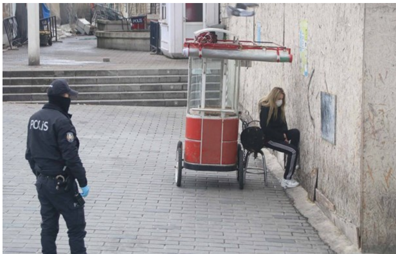
Figure 6. "The Woman Who Carries Corona Virus Has Escaped From The Hospital." Resource: www.sozcu.com.tr , 05.02.2020.

Another area in which ambage is heavily seen is that individuals over the age of 65 who are being treated in hospitals due to the Corona virus outbreak escape from the quarantine area or they want to be with their relatives who are treated by not fulfilling their role expectations and resort to violence. Figure 5 is about a patient who escaped from quarantine in Turkey. In Figure 6, the news