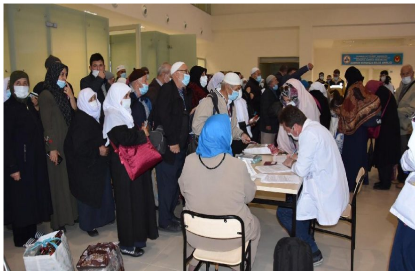
Figure 10. " They Were Sent Home: They Will Pay Attention. "