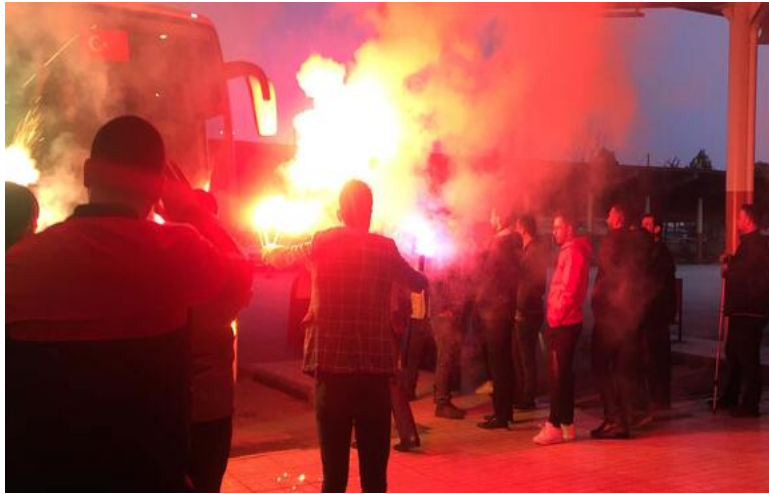
Figure 7. “ Crowd Soldier Farewell Against to All Warnings” Resource: www.sozcu.com.tr , 23.03.2020.

text of a patient escaping quarantine in Austria is presented. This indicates that individuals all over the world do not fulfill their social roles. Another area in which social roles were suspended by the government due to the epidemic was the interruption of the Friday prayers for a while in the mosques with soldier hopping ceremonies where citizens came together in crowded groups. However, ambage is considered to be quite high in both matters.