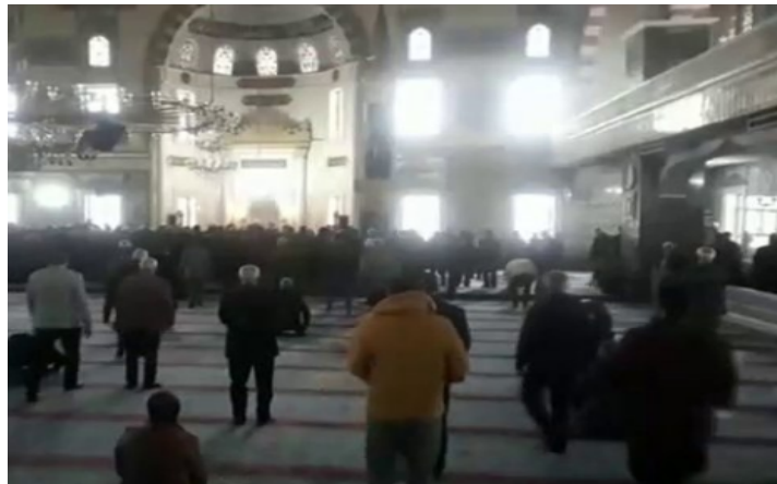
Figure 8. “They Prayed With the Community Against to All the Warnings of the Religious Affairs”

Military ceremonies is a practice that has become the custom in Turkey. Despite the prohibition of soldier farewell ceremonies by the Ministry of the Interior, young groups do not fulfill their role requirements. Nevertheless, despite the extent of the epidemic, no measures are taken in the bus terminals that are sent off by soldiers, and the ban on “social isolation” is violated by people of all ages. Face to face social relations are not suspended due to the outbreak. Social identities create disruptions in meeting the role requirements, despite the severity of the outbreak and sanctions.