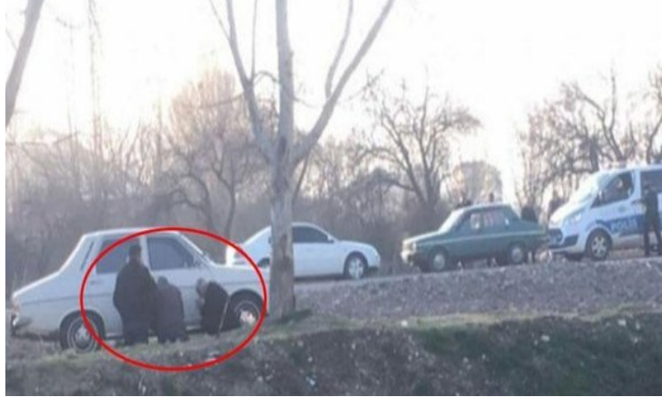
Figure 18. "Older Uncles were Hidden From the Police."

In the news text presented in Figure 16, it is explained by the Ministry of Interior that citizens over the age of 65 are prohibited from going out on the streets due to the epidemic of the corona virus, while individuals over 65 who are trying to go to the park resist police teams and journalists. In Figure 17, it is stated that individuals over the age of 65 are hiding in order not to be punished when they see the police teams. On March 21, 2020, it was announced by the government that individuals over the age of 65 were prohibited from going out, and that they would be punished with a fine of 3,150 TL if the rules were not followed. However, despite banning practices, it is observed that in many cities, this rule has not been followed, even though sanctions and sitting benches in parks have been lifted, individuals over 65 have been on the streets. The measures taken and prohibitions due to the increase of the corona virus outbreak in Turkey increases their disobedience and switches to the crisis.