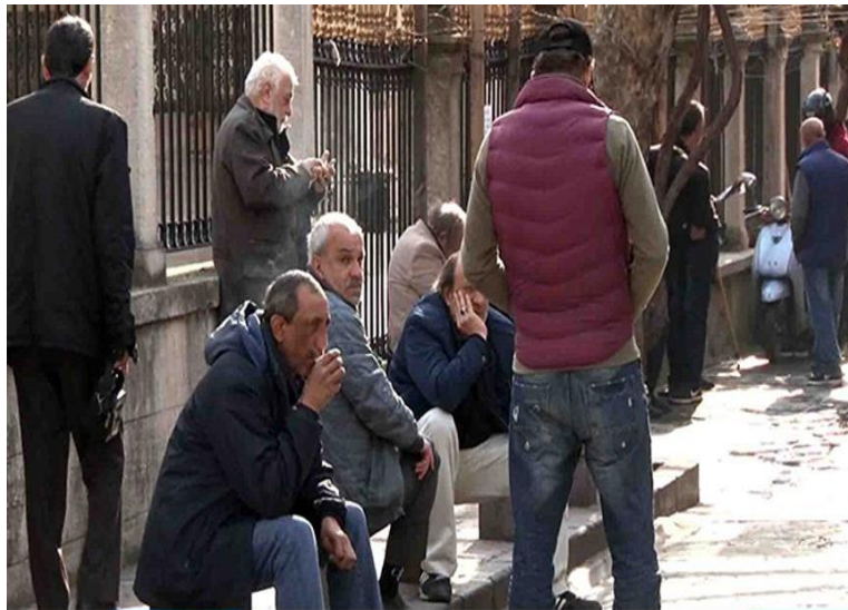
Figure 4. “Citizens Over 65 Years of Age that Do Not Follow the Rules Have Been Fined.” Resource: www.sozcu.com.tr , 25.03.2020.

In order to prevent the spread of epidemics and deaths in the society, the government has set out how social roles should be exercised (enforced) in individuals over 65 years old and chronic patients. In the news texts presented in Figure 3 and Figure 4, it is emphasized that despite the