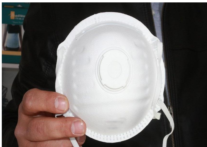
Figure 14. "The Virus Has Helped Opportunists." Resource: www.sozcu.com.tr , 27.02.2020.

Instead of the possibilities planned by China on a global scale, the Corona virus outbreak is creating new identities, and these new identities create contingency both globally and locally. However, like other countries of the outbreak, how to change their status after the identity seen in Turkey will be affected and in what way is uncertain.