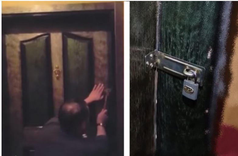
Figure 19. "Quarantine Shock from Neighbor to Umrah Citizen."

In the news text presented in Figure 16, it is explained by the Ministry of Interior that citizens over the age of 65 are prohibited from going out on the streets due to the epidemic of the corona virus, while individuals over 65 who are trying to go to the park resist police teams and journalists. In Figure 17, it is stated that individuals over the age of 65 are hiding in order not to be punished when they see the police teams. On March 21, 2020, it was announced by the government that individuals over the age of 65 were prohibited from going out, and that they would be punished with a fine of 3,150 TL if the rules were not followed. However, despite banning practices, it is observed that in many cities, this rule has not been followed, even though sanctions and sitting benches in parks have been lifted, individuals over 65 have been on the streets. The measures taken and prohibitions due to the increase of the corona virus outbreak in Turkey increases their disobedience and switches to the crisis.