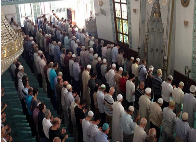
Figure 11. "Will Friday Prayer Be Performed? Explanation of the Religious Affairs that it will not be Performed Friday Prayer."

not go out and accept visitors for 14 days. In the face of public chaos, identities responsible for public administration take action by providing preventive measures to create safety situation. The religious identity, on the other hand, acts by reckless rules in the opposite position of the actors. In an environment of chaos, it indicates the ambiguity between the rules of two different strong identities.