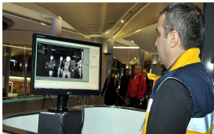
Figure 13. "How Corona Virus Affects the Turkish Economy?" Resource : www.sozcu.com.tr , 28.01.2020.

Corona virus epidemic creates contingency in many countries affected by the epidemic to varying degrees, especially in the economic field. The chaos caused by the epidemic in social life reveals the uncertainty in China's export market, which is defined as the third biggest power of the world in the field of production, and the possibility of importers to move to other countries, namely new