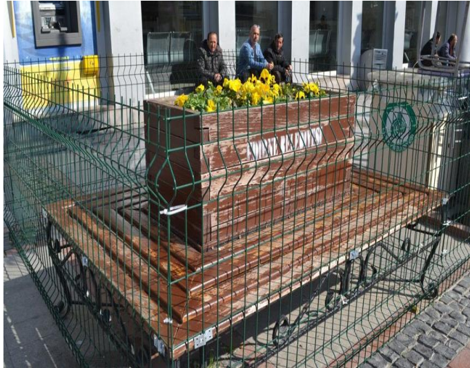
Figure 3. “Wire Netting Corona Virus Prevention Over 65 Years of Age

As the scientists point out, the Corona virus epidemic affects the elderly and chronic patients defined as risk groups more negatively and even causes death. According to WHO, the majority of those who lost their lives due to the epidemic are elderly and chronic patients. Turkey Statistical Institute of 9,1% of the population according to the 2019 survey constitutes the population aged 65 and over. For this reason, the curfew was introduced for the elderly in order to minimize the fatal consequences of the epidemic and the number of cases. If the ban is not followed, a fine of 3.150 TL will be imposed under the Law on Misdemeanors. The basic needs of individuals over 65 years old and chronic patients will be met by the officers through telephones 112, 155 and 156.