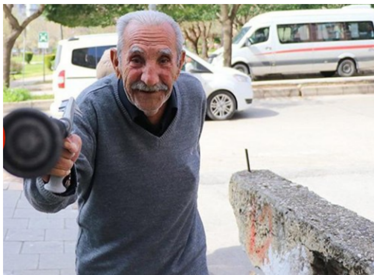
Figure 17. "Man Resisted in 78 Years: I Didn't Hear Corona Virus." Resource: www.sozcu.com.tr , 23.03.2020.

When the Corona virus epidemic began to emerge in Turkey, has begun to deteriorate harmony in social relations network that specific roles in the existing order. Turner describes this process as social drama.