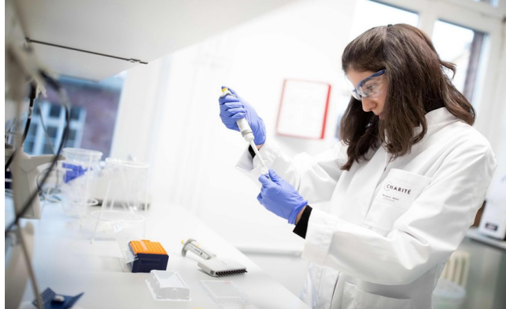
Figure 15. " Local Vaccine Statement by Health Minister Koca " Resource: www.sozcu.com.tr , 24.03.2020.

In Figure 15, it is suggested that the Ministry of Health Vaccine Institute has started the vaccination studies against the corona virus. Identities create a big change in field of possibles to create safety footing and control, and begin vaccination efforts to eliminate uncertainties.