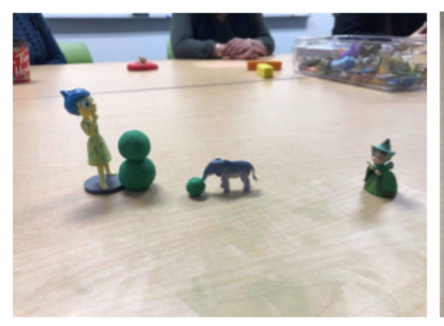
Figure 1. Arts-based data collection method

Participants were provided with a selection of figurines and playthings as well as different colours of clay.