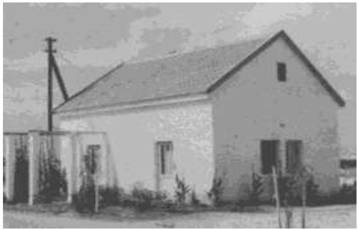
Figure 1: The Shack: this building became known as "The Shack", was dedicated to the documentation and commemoration enterprise inaugurated at Kibbutz Lohamei Haghetaot, installed at the Holocaust and Uprising Remembrance Day, 1951.

During this initial period of dependence after the War of 1948, Kibbutz Lohamei Haghetaot began implementing its own traditions, as well as the collecting of artifacts and documents, in 1949. This facility would go on to become the Ghetto Fighters' House Museum. A kibbutz founded by survivors, many of them survivors hailing from the Warsaw Ghetto uprising, the members sought to memorialize the past with an aggressive heroic agenda. Thus the commemorative functions were laced with heroism and archival documents began to accumulate based on this ethos. But they also had an assortment of items-things, which would later on be known as artifacts-in individual possessions. More than likely, it was the first known museal site once they erected a building to house them. Therefore, in a very spontaneous manner, various members brought in memorabilia, ranging from photographs to some objects they were able to hold on to, and these were stored and displayed.<sup>18</sup> Displayed in a shack adjacent to the main commemoration facility this was a "temporary improvised exhibition" The building was somewhat remade and in 1951 it was dedicated as the museum building, though for years it was referred to as "The Shack."<sup>19</sup>