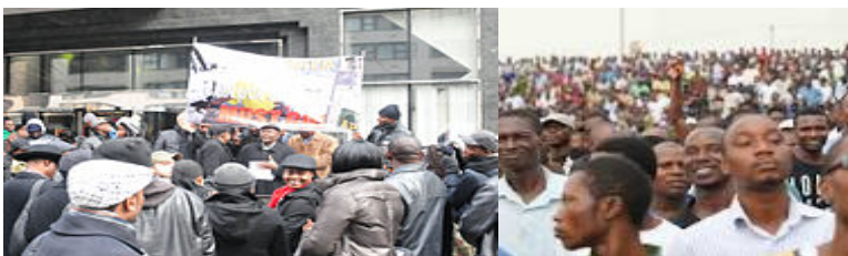
Occupy Nigeria protesters in New York City.