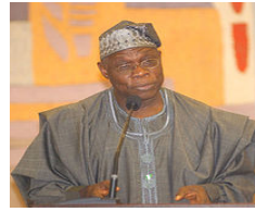
Former President Olusegun Obasanjo (Brasilia 6 September 2005)

It still is a mystery how the cost of subsidy shot up to 1.3 trillion naira in just one year of President Goodluck Jonathan's administration, especially since ex-President Olusegun Obasanjo's administration spent 300 billion Naira per year. When the Obasanjo government left power in 29 May 2007, the country was no longer in debt and the 30 billion dollar foreign debt that Obasanjo met when he came to power in 1999 was fully paid off. Today, under the administration of Jonathan, the country owes debt to the tune of 30 billion dollars and is still borrowing. It was reported that when the Obasanjo administration left power in 2007, 23 billion dollars was left in the Excess Crude Account after he built it up from nothing in 1999; by January 2012 the account was empty because the money has been "squandered and the account scrapped".