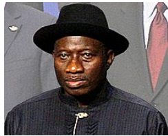
Goodluck Jonathan at the Nuclear Security Summit 2010