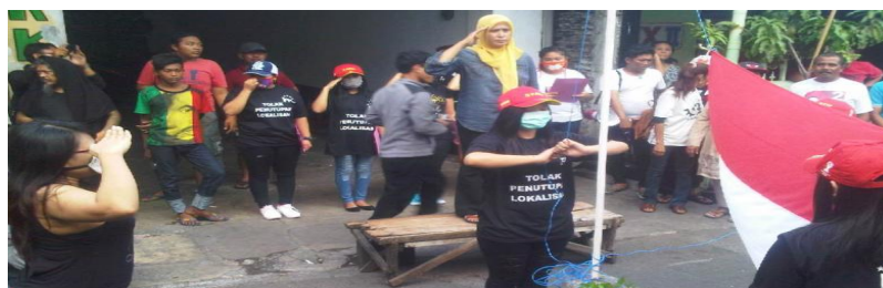
Figure 3. Implementation of the flag ceremony followed by commercial sex workers, Pimps and residents around Dolly red light district

The flag ceremony carried out by dozens of sex workers has the aim that the government and all people know that CSWs are Indonesian citizens who love the country, always maintaining the values of national unity and integrity, fostering a spirit of nationalism, and enhancing a sense of togetherness. For this reason, they asked that their fate and life be considered and heard by their aspirations.