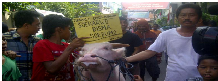
Figure 4. Procession of White Buffalo around Dolly Red Light District as a tumbal of Dolly citizens

The next symbolic action is to parade the white buffalo around Dolly red light district and end with the slaughter of the animal as tumbal . In the Indonesian language dictionary, tumbal is defined as something that is used to reject reinforcements or offerings to get something better. The procession was started from the Red light district Work Front Post, then entered the red light district alleys in the area. When parading the buffalo, there is a paper card with 'Tumbal of Dolly-Jarak' on it. In addition, the cardboard was also written the name of the Governor of East Java, Soekarwo, Mayor of Surabaya, Tri Rismaharini and Head of the Surabaya Social Service, Supomo. More can be seen in Figure 4.