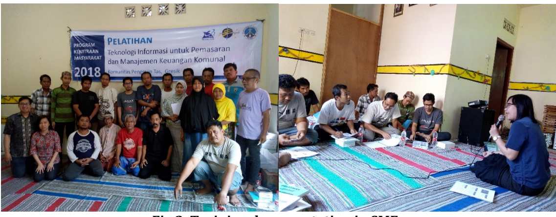
Fig 2. Training documentation in SMEs

.from these results it can be seen that partners are still having difficulty using technology. then it can be concluded several things as follows. The implications of the use of technology cannot be adopted or accepted equally by all people, especially those born before the digital era, or living in rural settlements. This can be seen from their difficulties in using and understanding the process of using e-commerce technology. Both e-commerce systems can be an alternative for sales and media promotion for partners, but it will not necessarily replace what is currently available, partners still prefer brick-and-mortar models compared to click-and-dot-com business models. This is in line with what was conveyed in Cheung's research (Cheung & Vogel, 2013) and Rahayu (Rahayu & Day, 2015).