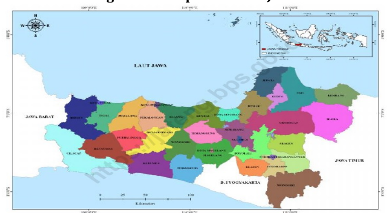
Figure 1.1 Map of Central Java

Central Java is one of Provinces in Central Java flanked with two large provinces: West Java and East Java. Central Java lies between 5°40' and 8°30' South Latitude and between 108°30' and 111°30' East Longitude. Central Java consists of 35 Regencies/Cities: 29 Regencies and 6 Cities (BPS, 2018).