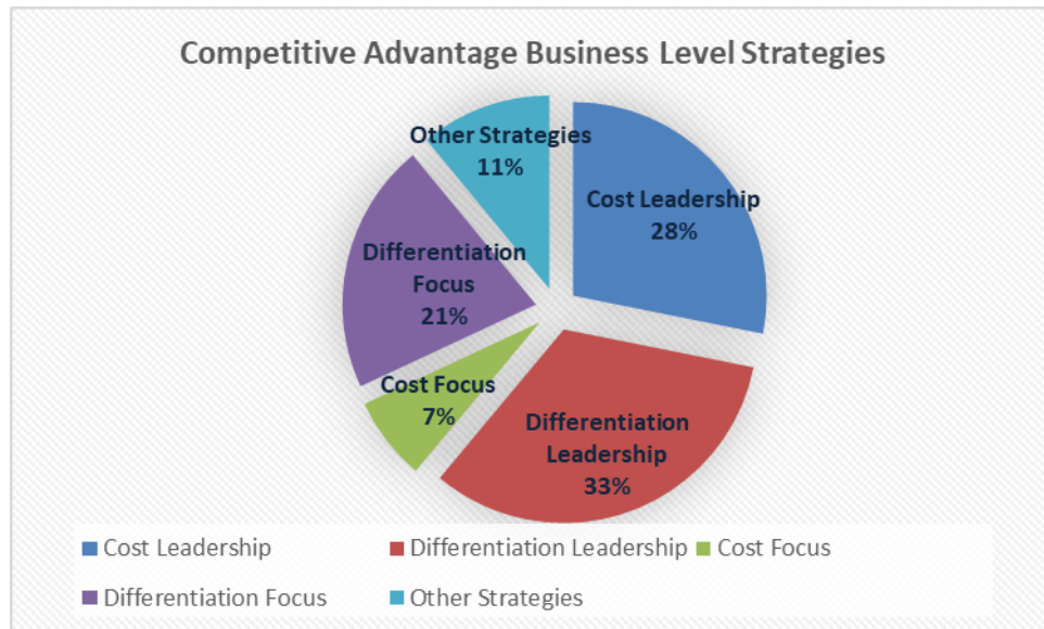
Figure 4: Competitive Advantage Business-level strategies

It's very noticeable that the micro organizations have the highest counts in all strategies. The big organizations have the highest percentages when it comes to the "other" strategies, which were not mentioned as an answer option in the survey. However, the majority of organizations are applying product/service differentiation strategy. They offer a product or service that is in high demand, but with unique characteristics. On the other hand, the minority of organizations focus on the cost (7%). They offer a product or service in a niche market, and they ensure the lowest possible price.