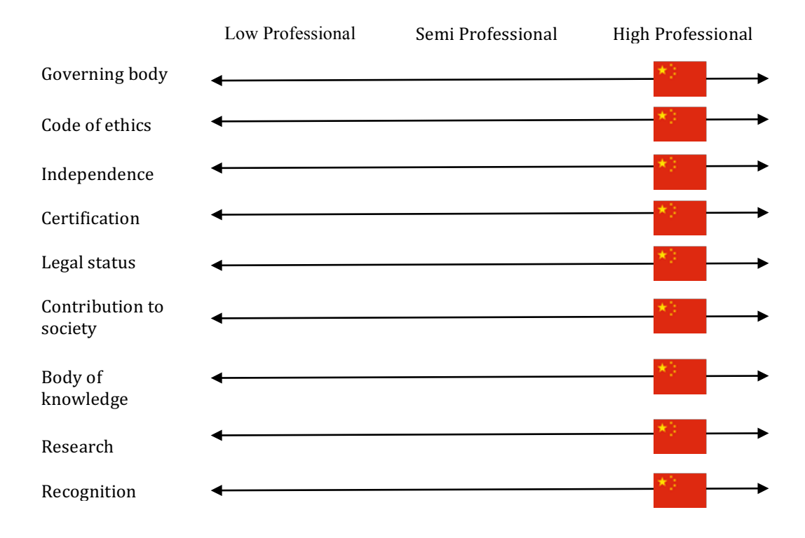
Figure 3 Accountancy Professionality Continuum

In general, Chinese accountancy profession is a widely recognized profession with high professional status since its establishment. Accounting reforms allow Chinese individuals and companies to do business more easily with other industrial countries. However, the role of accounting departments in some organizations is still in low competency (Sangster, 2015; Huang et al., 2013). Compared to the mature markets in Western countries the accountancy profession in China is still on the road to achieve a higher status. Today, China's accountancy profession is well headed down the path of achieving convergence with international professional standards. Indeed, in line with economic development, China is exerting tremendous influence on the global stage, indicating the increasing recognition of the accountancy profession.