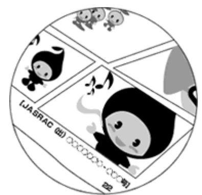
Fig. 2. JASRAC number when posting lyrics in cartoon

This is the responsibility and duty at the same time for the organization, JASRAC must have. Since JASRAC is entrusted rights from the original creators, it is important to put best efforts to protect their rights and compensation. However, these activities have been controversial in music market. JASRAC started to gradually expand royalty collection targets according to performance rights of music organizations since 2003; Physical Education facilities in 2011, cultural center in 2012, dance academies in 2015 and singing classes starting from 2016. In February 2017, JASRAC announced to collect royalty from music classes starting from 2018. As a reaction to this, music education organizations centering on 'YAMAHA Music Class' created