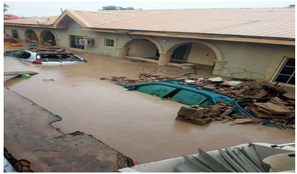
Fig. 2: Flooding causing drowning of cars and houses.

Agboola and Olurin (2003) reported that the World Bank ranked coastal erosion as needing moderate priority attention in the Niger Delta. Also, the Nigerian Environmental Study/Action Team (NEST), reported that sea-level rise and repeated ocean surges will not only worsen the problems of coastal erosion that are already a menace in the Niger Delta, the associated inundation is increasing problems of floods, intrusion of sea-water into fresh water sources and ecosystems destroying such stabilizing system as mangrove, and affecting agriculture, fisheries and general livelihoods (NEST, 2004).