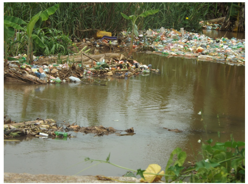
Fig. 1: Flooding in the Niger Delta region, causing solid wastes to be washed into a river body