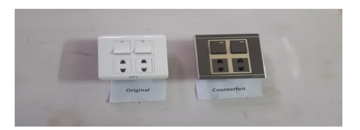
Figure 1. showing switches and buttons both genuine and counterfeited. The counterfeit one is made of low quality plastic and slightly change is design.