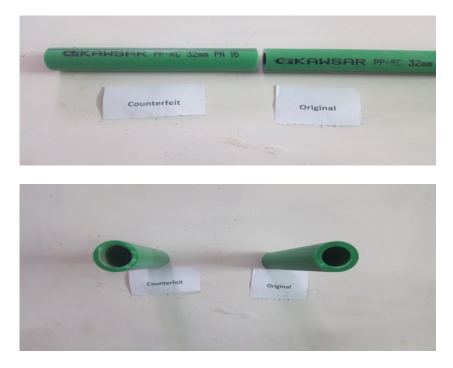
Figure 4. showing both original and counterfeit KAWSAR company pipes. Counterfeit pipes are identified form the color which is slightly different then original one and its gauge is 3mm where as original pipe gauge is 4mm.

Figure 3 showing GM cables and it is identified as genuine because its wires are of full gauge.