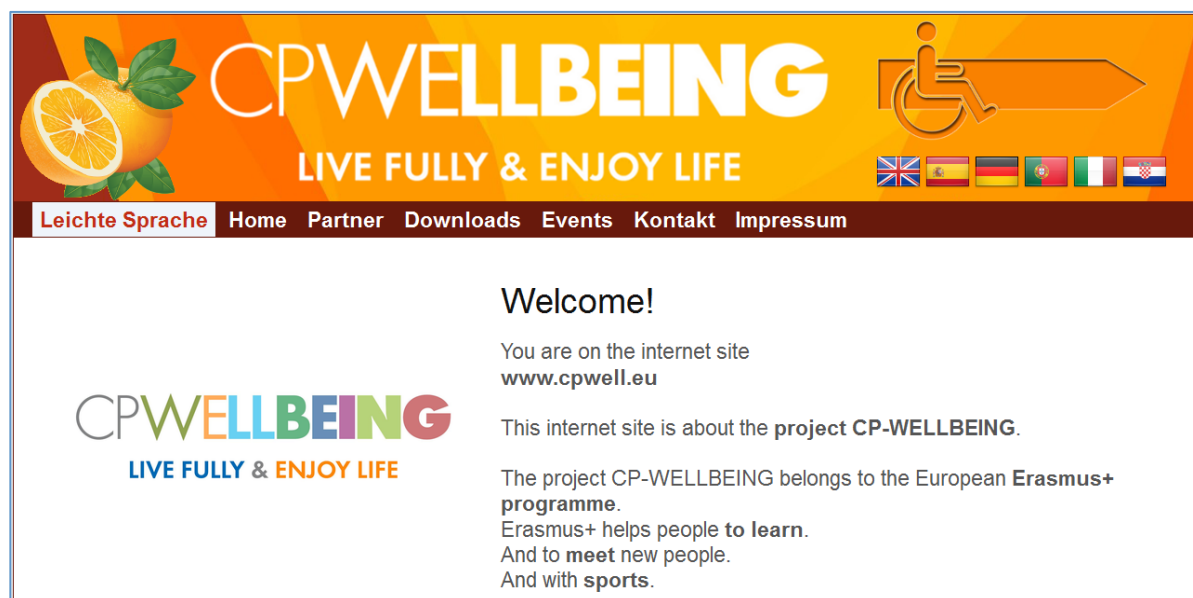
Figure 2: CPWELLBEING Website – http://www.cpwell.eu

The Erasmus+ project CP-WELLBEING http://www.cpwell.eu/ is launched with the main objective of increasing the competences (attitudes, skills, knowledge) of Persons with Cerebral Palsy – CP- teachers, families and professionals through an innovative training program supported by a digital training platform. Figure 2 shows the project website.