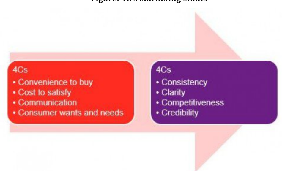
Figure: 4C's Marketing Model

"The 4Cs for marketing communications: Clarity; Credibility; Consistency and Competitiveness (Jobber and Fahy, 2009)"