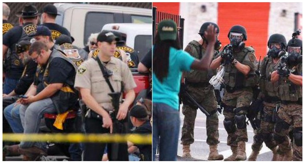
Diagram 2: Photo included in a tweet that refers to white privilege

Theme 6 closely aligns with Themes 1 and 5, which include references to cover-up and corruption/police brutality and cronyism (276 tweets; 10.2%). Members of the law enforcement team who handled the Waco biker case were depicted as crooked, corrupt or "bad cops." Tweets frequently focused on the idea that police officers were covering up information that they did not want to share with the public. They also focused on cronyism or the idea the the police officers helped the bikers because they were related or friends. In addition to focusing on police officers' tweets also characterized attorneys and judges and the court system as tampering with evidence. The idea of a "court conspiracy" emerged early in the case.