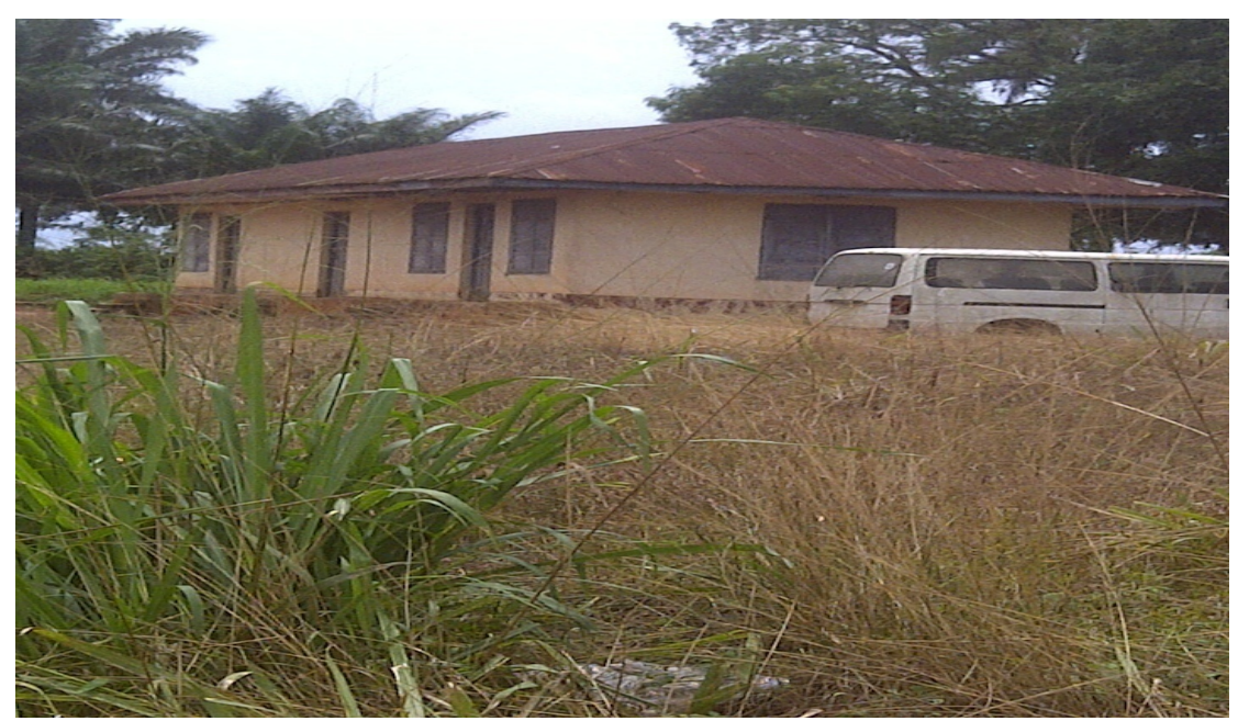
Figure 4: The Primary Health Centre in the community appears unused as it is overgrown with weeds

The community has three hospitals/ health centres. Two are owned by the government (Health Management Board and Primary Health care) while the third is owned by an individual. The surroundings of the Government health centres are unkempt as they are engulfed by weeds. A large number of the respondents complained of having the facilities either farther away from their dwellings or completely absent within their neighbourhoods. A large proportion of the inhabitants confirmed paucity of health facilities in this community (Figure 4). No doubt, in terms of infrastructure, there is a palpable neglect of Ekiadolor community by the government.