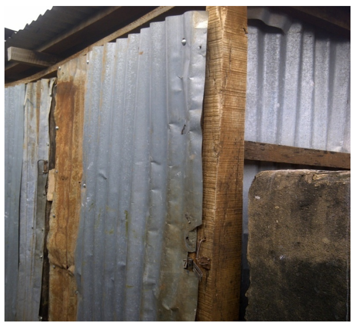
Figure 1: A typical latrine in the community

A large proportion of the buildings examined have bathrooms and kitchen, only that they are substandard, inadequate or inconveniently located. Many of the bathrooms are just small enclosures, some of which are made of materials like bamboo, rusted iron sheets, or planks and located at the backyard. The use of firewood and charcoal for cooking is common; hence many of the buildings have their kitchens located at the backyard, residents of such areas cook food in the open rendering food items and utensils vulnerable to disease causing pathogens. Only the few ones that used kerosene stoves cook at the passage or right inside their rooms.