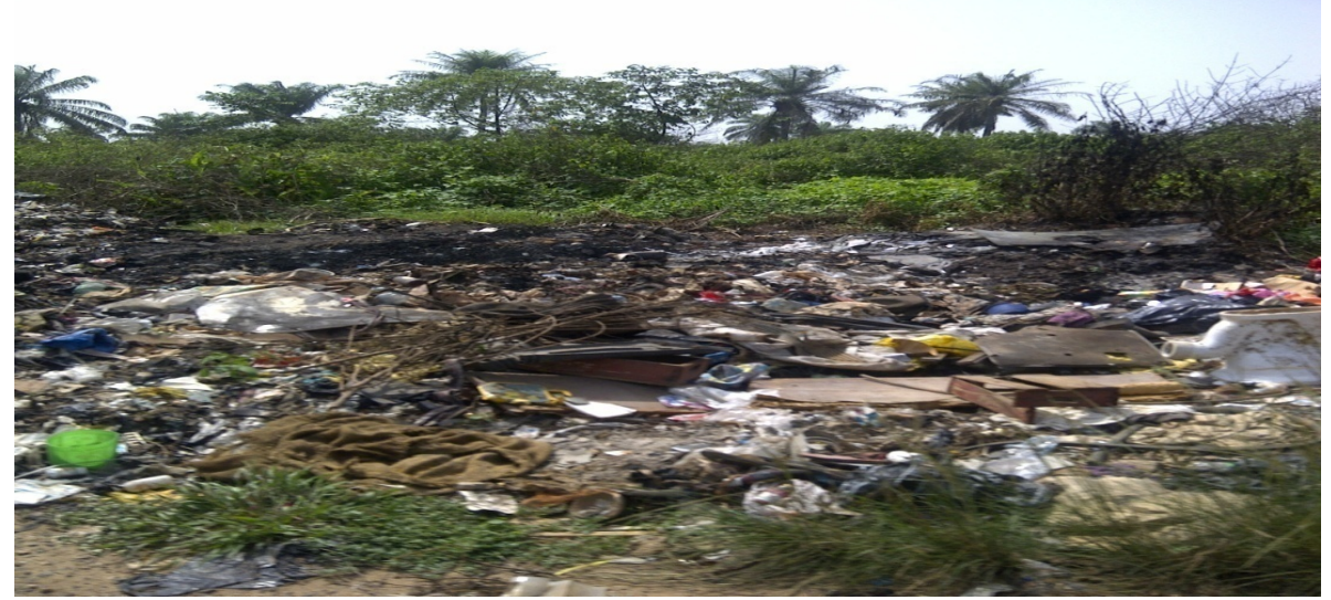
Figure 2: Indiscriminate dumping of refuse

The main source of electricity supply to the area is through the Power Holding Company of Nigeria (PHCN), which accounts for 92.5% of the sampled households. About 1.7% used generating plant as supplements (Table 3). This is quite impressive as respondents were of the opinion that supply of electricity in the community is constant except for a situation where a fault is identified, then such area affected may be put in total darkness for weeks or sometimes months. To ensure adequate supply of electricity, the community is furnished with three (3) transformers which were facilitated by community members through the Ekiadolor Community Development Association. This association has also helped in other areas such as road maintenance, supplies of instruction materials to schools and security among others.