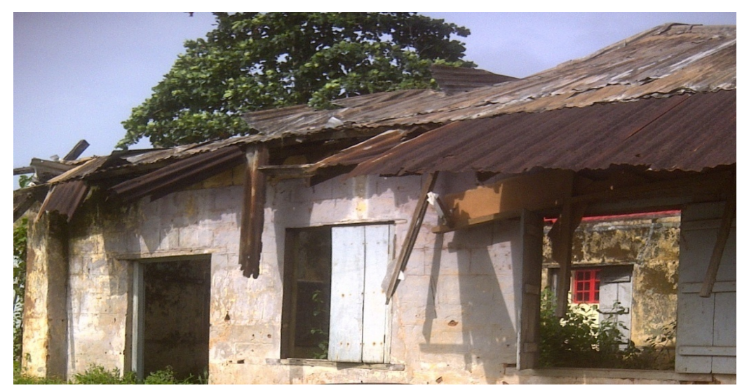
Figure 3: The existing schools is the community are in a state of disrepair Source: Authors' Field Work (2013)

Other facilities investigated in this category include school, health and security facilities. Educational facilities available are limited in number. There are three (3) primary schools, three (3) secondary schools (one owned by the Government and two private owned) and a higher institution located in the community. The schools are poorly funded, managed, lack good structures, learning facilities and conducive environment (Figure 3). The students also do not have access to water and toilet facility. They make use of open field for defecation.