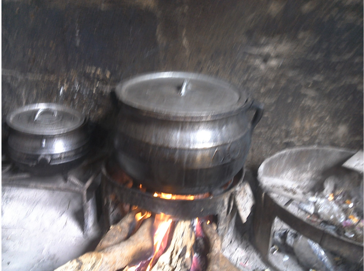
Fuelwood in action

Furthermore, access to woodfuels means having physical access to the source, the right to gather woodfuels from that source and having the necessary field labour available to collect and transport it. Such field labour is usually supplied by women and children in other part of the world but the story is different here at Gombe were the male dominate the business. It is the most available forms of energy that you can get free from natural forest reserves.