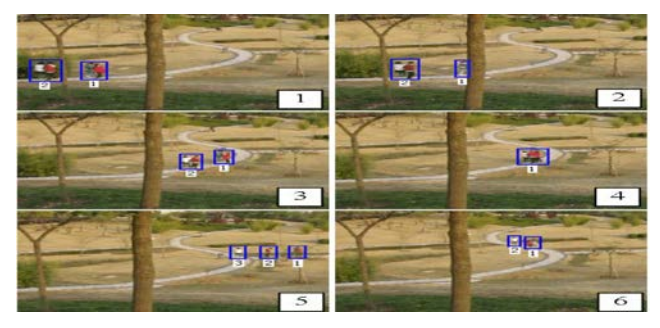
Figure 2: Experimental results of multi-target video tracking.