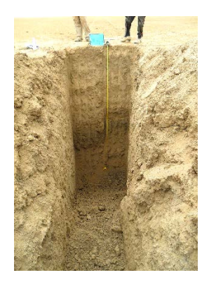
(B) Stratified with medium texture topsoil