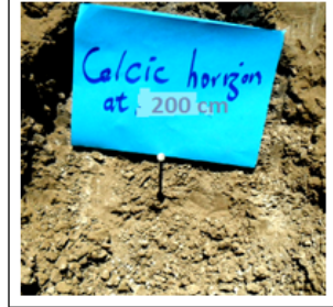
Figure 6: CaCO3 nodules, concretions and aggregates in Aridisols of Study area

A typical Aridisol profile in study area showing the upper dark gray topsoil with blocky structure, the dark gray weekly developed subsoil and the dark brown substratum mixed with pedogenic gypsum and calcium carbonate. The bottom horizon is often the location of mainly irregularly shaped soft powdery carbonates and gypsum with needle shape crystals. In some other profile hard carbonate nodule are as well located at the substratum. Very few, very small carbonate nodules are usually located at subsoil and topsoil.