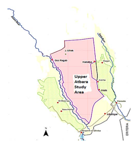
Figure 1: Location Map of Upper Atbara Study area. The map shows Atbara River, Gash River, New Halfa and Gash Delta Agriculture areas (Modified from [5])

The Upper Atbara study area is situated between Atbara River in the west and Gash River in the east with a total area of 751,290 ha. The area lies north of the asphalt road connecting Kassala and Khashm El Girba towns and extend northward further to north of Goz Ragab, Jebel Ufrek and Hadaliyah. As well along the eastern border of the area runs the highway which connects Kassala to Port Sudan. The area is nearly flat with relatively few water channels dissections in the south and predominantly windblown features in middle and northern parts. Khashm El Girba Irrigated scheme lies to the west of this area across River Atbara. The Gash River Delta which borders the area to the west comprises a large seasonal irrigated farming area (Gash Agricultural project). Figure 1 shows the location of the study areas [5].