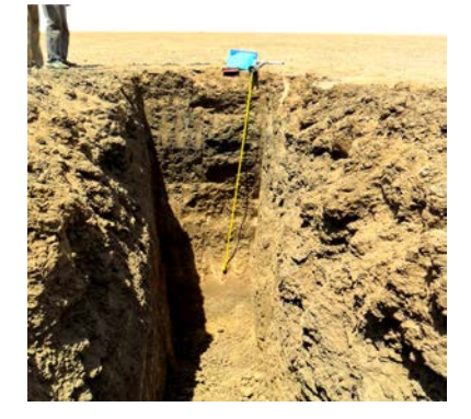
Figure 4: Aridisol profile (Vertic Haplocambids) at Study area