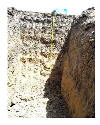
(A) Stratified with heavy texture topsoil