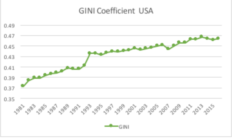
Figure 4: U.S. Census Bureau, Current Population Survey, 1968 to 2018.