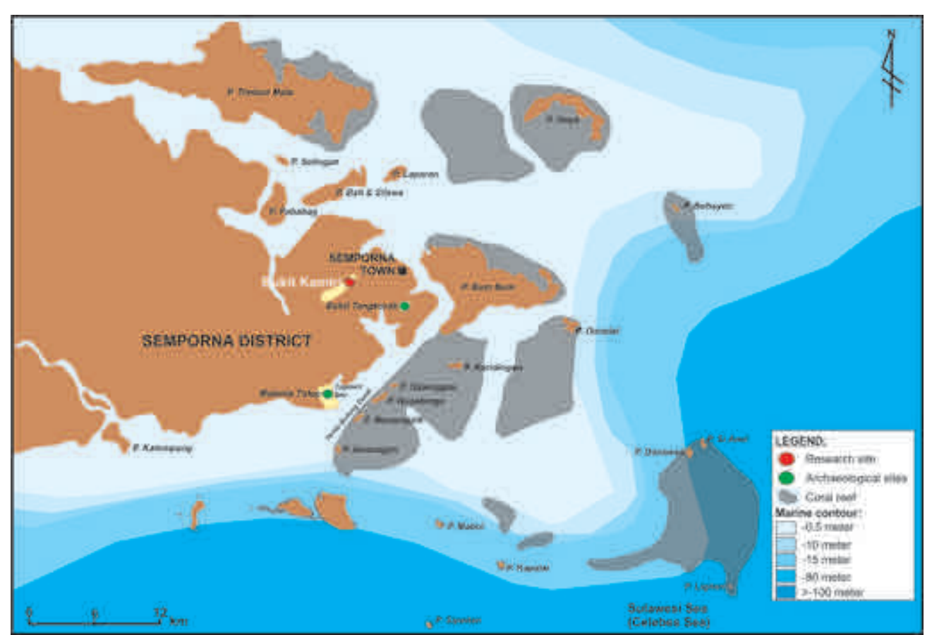
Figure 1: The location of Bukit Kamiri site at Semporna, Sabah, Malaysia. (Adapted from: LEMBAR (Sheet) 4/118/11)

reference books such as Saunders (1979), Dance (1992), Poutiers (1998a and 1998b), Reitz and Wing (1999), Allen (2000), Abbott, (2002), Fiene-Severn et al. (2004), Das (2006), Matsui (2007), Yule and Yong (2004), Hook (2008) and Azmi et al. (2010). Thus, the species of aquatic fauna exploited by the Metal Age societies in Semporna can be determined. Taxonomic data would also contributes to strengthen the interpretation on their adaptation and environment (Bekken et al. , 2004:333; Grabarkiewz and Davis, 2008:5; Cranbrook, 2010:374). Meanwhile, the statistical analysis approaches that are applied in this discusson are the number of identified specimens (NISP), MNI and weight. The analysis of NISP refers to the number of specimens (parts of skeletons and shells) that can be identified according to its taxonomy while the analysis of MNI determine the number of animals that are exploited based on the statistics of NISP (Klein dan Cruz-Uribe, 1984:25; Reitz and Wing, 1999:192; Renfew dan Bahn, 1996:273; Grant et al. , 2008:73; Giovas, 2009; Harris et al. , 2015).