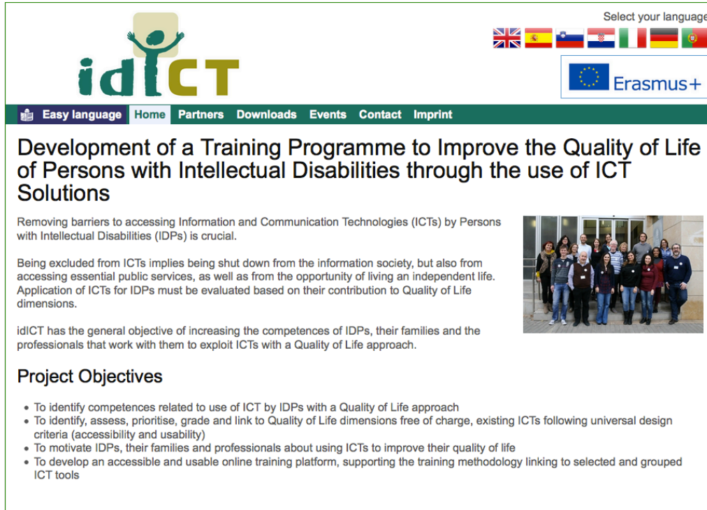
Figure 2: idICT website – www.id-ict.eu

The ongoing European Erasmus+ project idICT - Development of a training program for improving the Quality of Life of Persons with Intellectual Disabilities through the use of ICT solutions - aims at the use of inclusive educational technologies to improve the education and independent living particularly of this group. Existing ICT and possibilities to be used in inclusive education will be identified and asses. Training programs to use such inclusive ICT for people with intellectual disabilities and trainers will be developed and tested in five Eu-ropean partner countries. It is intended to promote inclusive education for people with intel-lectual disabilities.