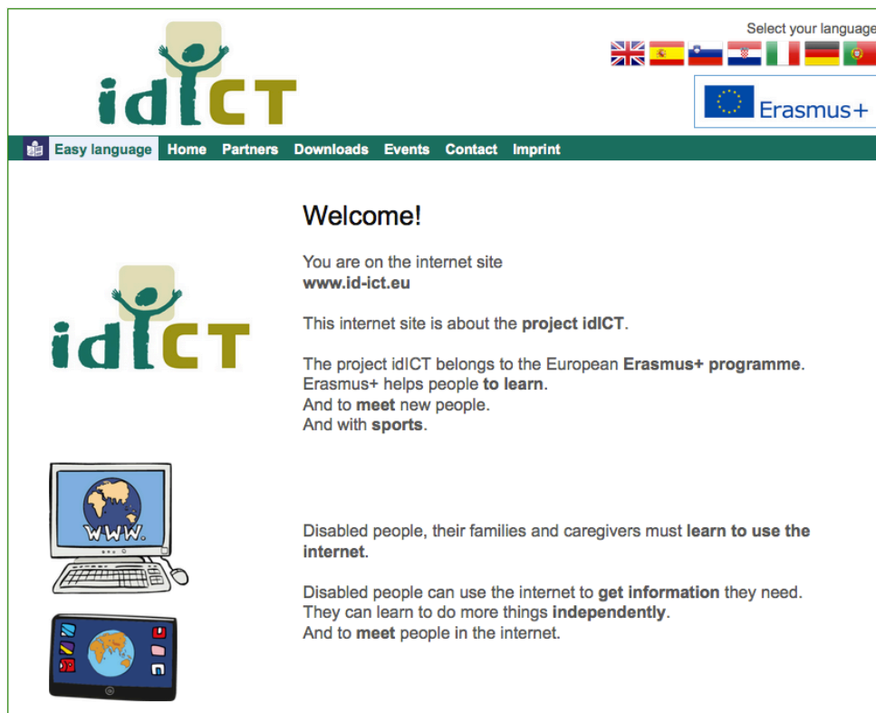
Figure 3: idICT website in easy to read language